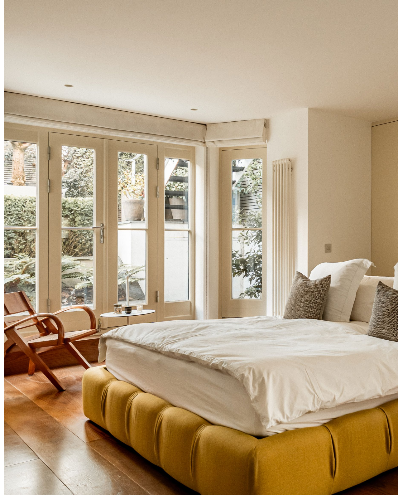
The Little Boltons