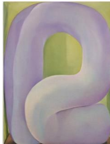
Lucy Whitehead, The Trophy Room