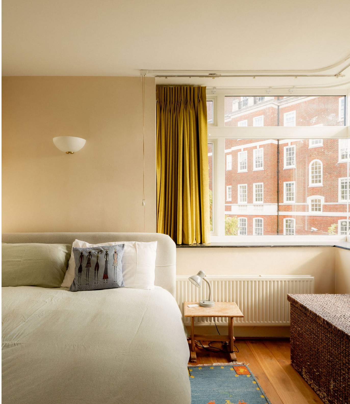
Plane Tree House