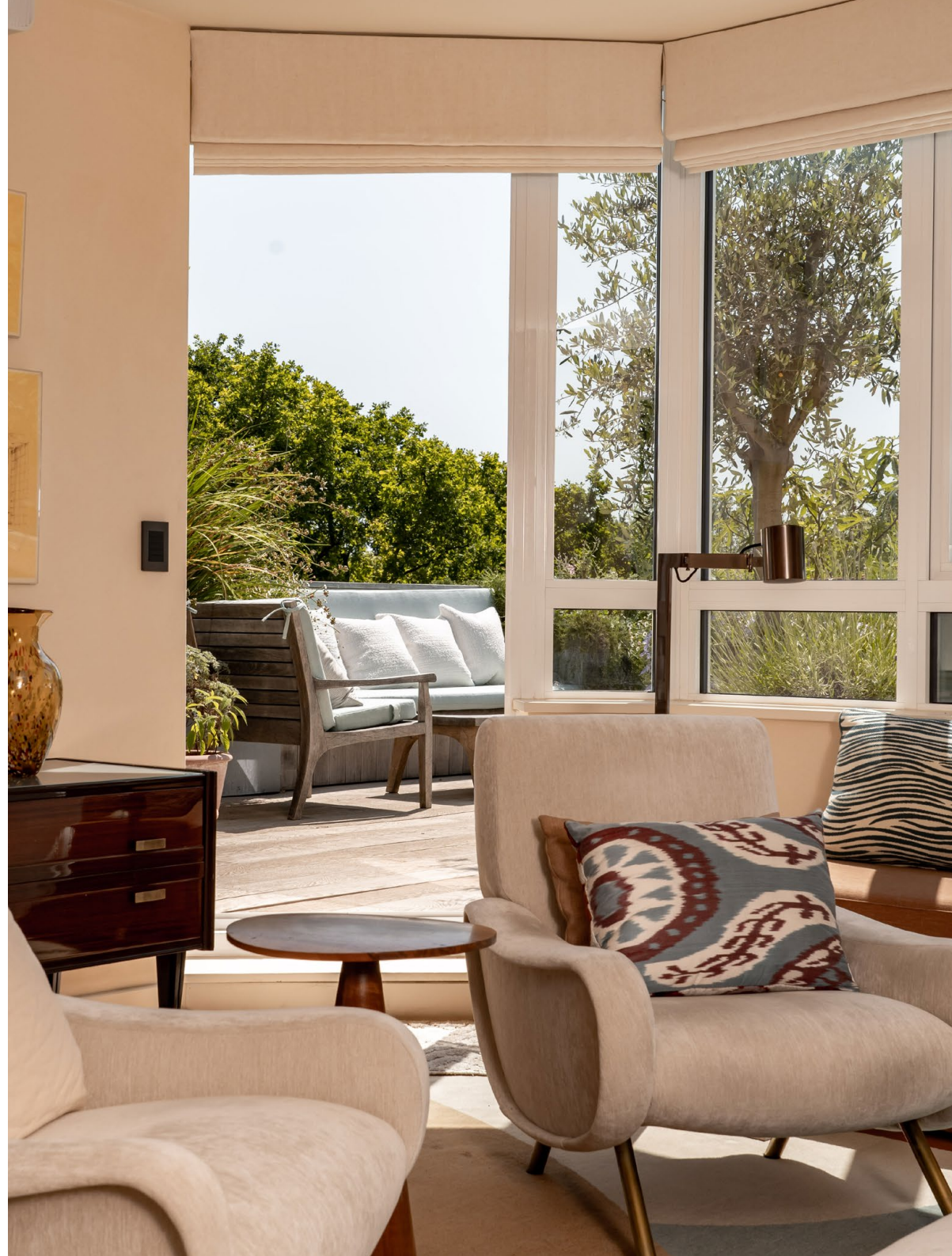
Hyde Park Towers